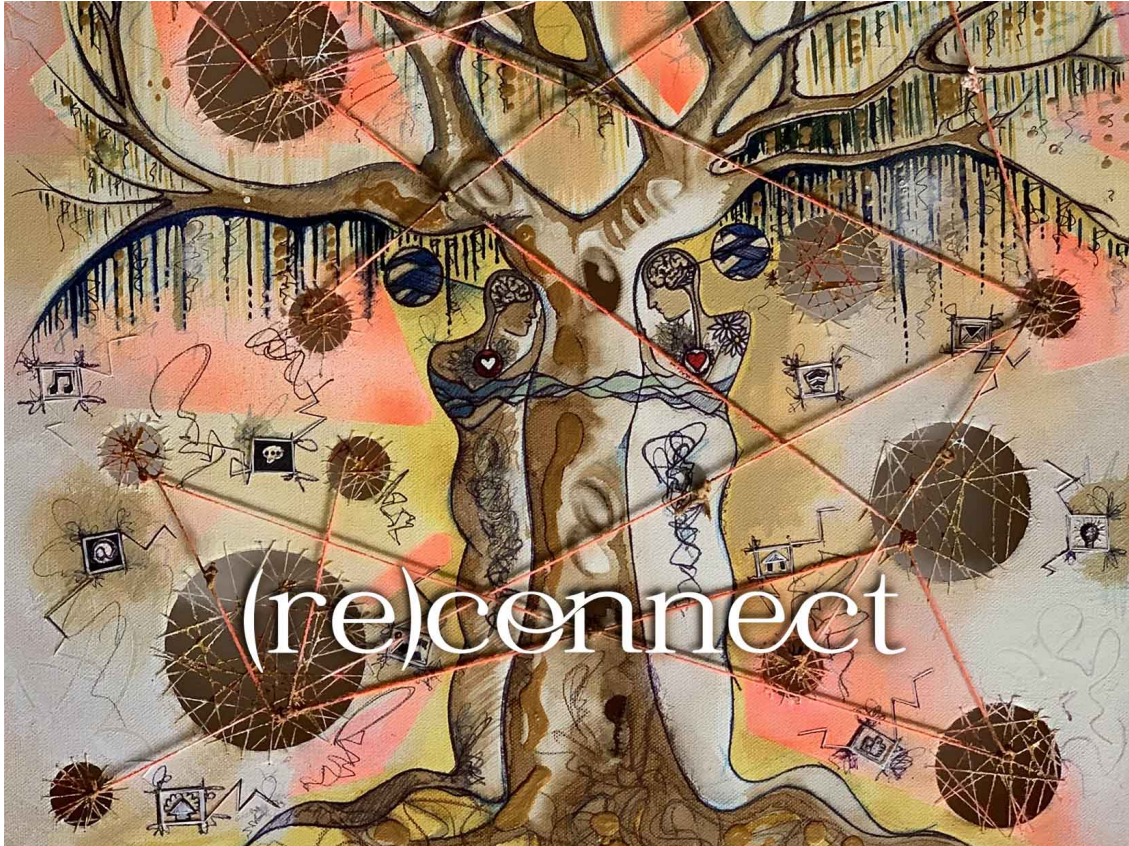
Cover Photo: (Re)Connect by Charlotte Esposito