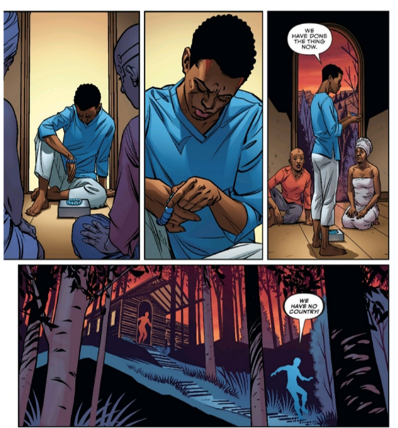
Figure 2: Aneka removes her Kimoyo band and declares herself stateless (Coates et al. 2016, p. 101).

The removal of Aneka’s Kimoyo Bead is almost entirely performative, as she remains connected to her people and committed to fighting for their democracy, rights and safety. However, as discussed previously, performative actions can still foster connections, inspire others and create collaboration between similarly minded individuals. The performative actions that both connect and disconnect in Black Panther can be used to consider how similar events and discourses operate within our own society and the effect that they have on social or political movements.