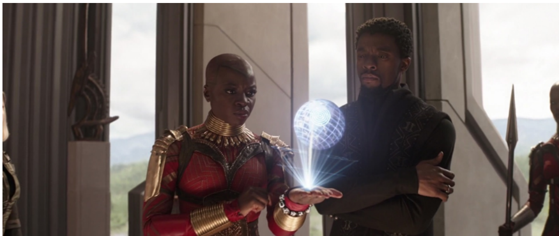
Figure 4: Okoye and T'Challa use the Kimoyo bead's communication and information technologies to strategize Wakanda and the rest of the Avengers response to Thanos' army ( Avengers: Infinity War , 2018, 01:33:20).

Likewise, it is important to restate the role that Kimoyo Beads and technology play in both connecting and unifying the people of Wakanda within the Black Panther universe. I have also mentioned the similarities in the way that both social media and Kimoyo Beads can be used by different social groups and movements to facilitate collaboration, share information and organise effective action. Figure 4 shows how Wakanda uses this technology to organise their own response to Thanos’ threat in Avengers: Infinity War (2018), as well as how they share the information with the rest of the Avengers to create a collective, informed plan of attack.