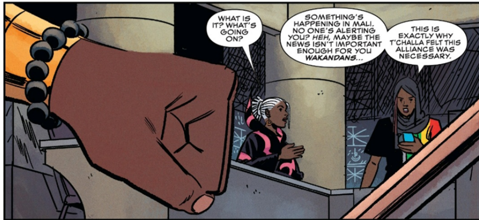
Figure 1: A close up of Okoye's Kimoyo beads in Shuri (Okorafor et al. 2019, p. 91.)

Vibranium is one of the rarest materials in the whole of Marvel lore and can only be found in Wakanda. Martin Lund argues that “Lee and Kirby’s Wakanda is a composite of colonial imagery” and describe it as a “tribal kingdom with highly desirable natural resources” (2016, p. 8). However, Wakanda has never experienced the horrors of colonialism first-hand, apart from interactions with the villain Ulysses Klaw 6 .